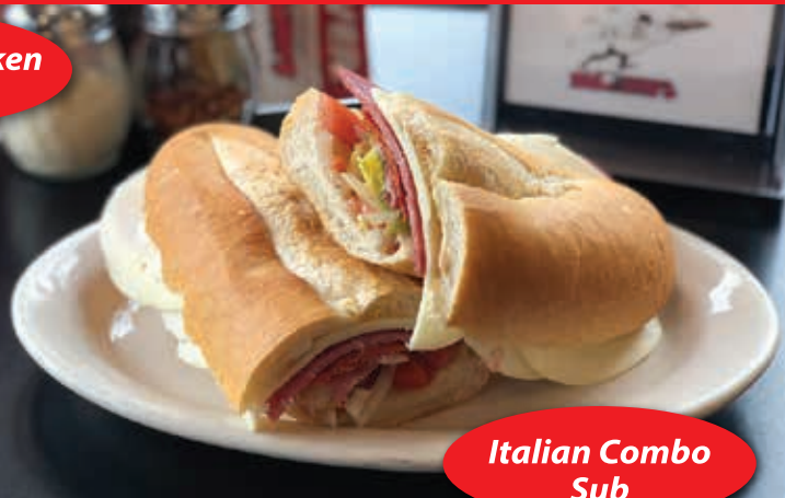
Italian Combo Sub