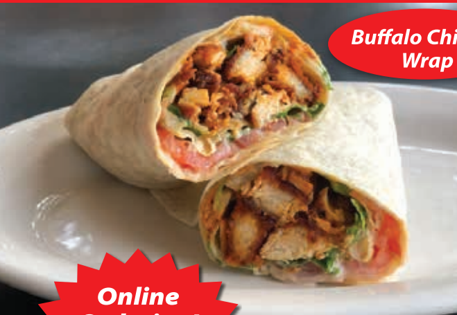
Buffalo Chicken Wrap